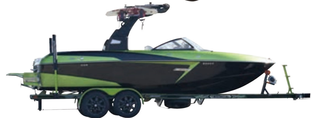
FRONT BOARDING LADDER (optional)