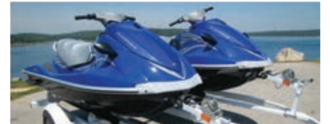
PERSONAL WATER CRAFT