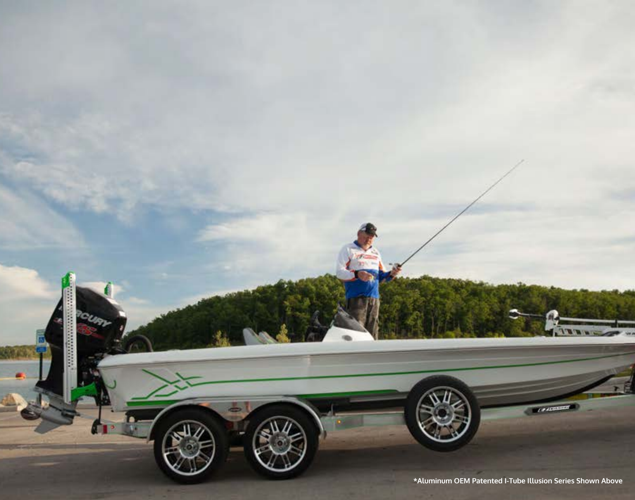
*Aluminum OEM Patented I-Tube Illusion Series Shown Above